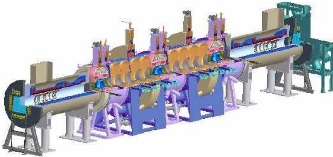
Figure 3. Drawing of the MICE experiment [48]. The beam enters the experiment from the bottom left-hand corner. The beam first passes through one of the scintillator hodoscopes that form the time-of-flight system. After passing through the upstream spectrometer, the beam passes through three absorber/focus-coil modules and two cavity/coupling-coil modules before it passes through the downstream spectrometer and, a second time-of-flight hodoscope, the downstream Cherenkov counter and is stopped in the electromagnetic calorimeter. The beamline and upstream instrumentation is not shown.

in the cavities as the muon traverses the experiment. The upstream and downstream spectrometers are each composed of a 4 T superconducting solenoid instrumented with a scintillating-fibre tracking device. Downstream of the cooling channel a final TOF station, a Cherenkov counter and a calorimeter are used to distinguish muons and electrons.